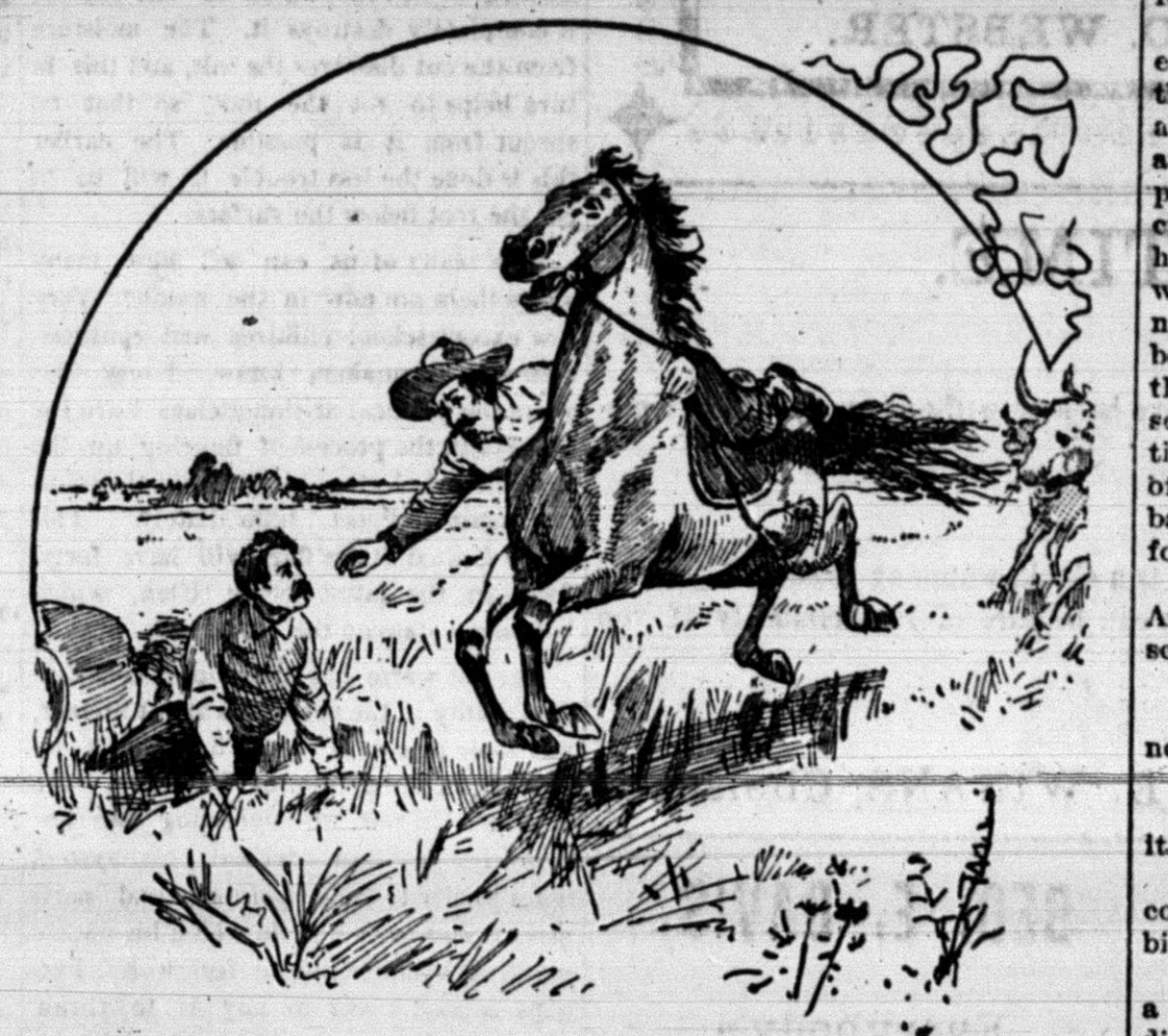
HE LEANED FAR OVER.

Till his face was black and gory; He covered himself with scars and stripes. All for his country's glory. —Chicago Record.